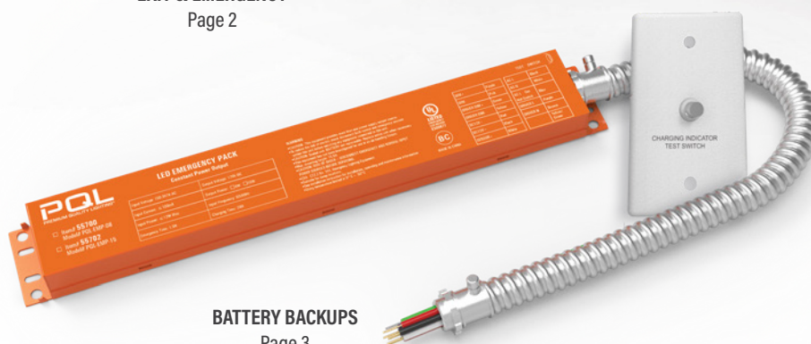
BATTERY BACKUPS Page 3