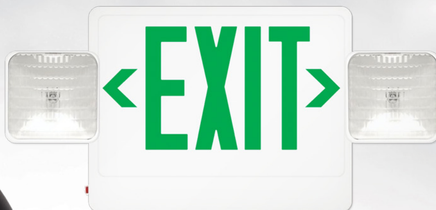
EXIT & EMERGENCY Page 2