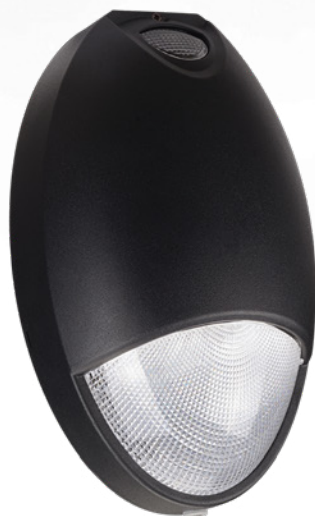
EMERGENCY LIGHTS Page 2