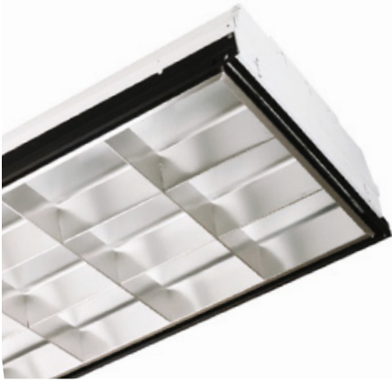
Item#: 55018 2X4 - 12 CELL PARABOLIC 2/F32 FLUORESCENT FIXTURE