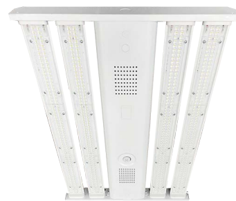
45° Optic Kit (#55797)

Kit includes; 12 clear lenses and 48 screws. Fixture sold separately.