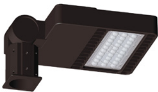
Slip Fitter with Item#: 83505, 83509