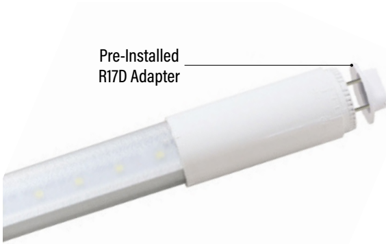
Pre-Installed R17D Adapter