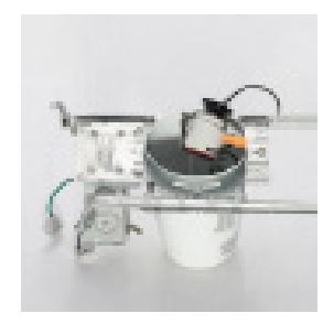
STEP 2: Twist adaptor into socket