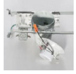
STEP 3: Insert male connector into female one.