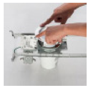
STEP 4: Push in the can.