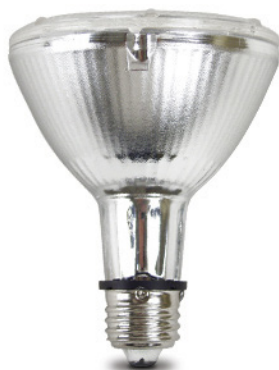
Item#: 91206 CMH PAR30 FLOOD CERAMIC METAL HALIDE