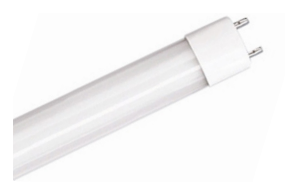
Item#: 91323 LED PLUG & GO™ LINEAR T8 REPLACEMENT LAMPS (PLUG AND PLAY) (UL TYPE A)