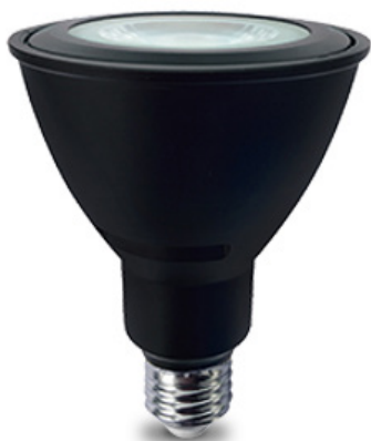
Item#: 91392 LED PAR30/LN LAMP REFLECTOR (NARROW FLOOD)