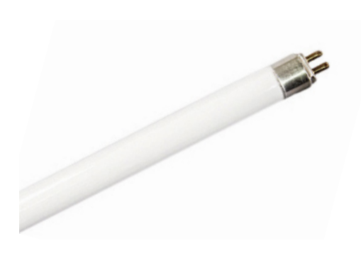
Item#: 91724 LINEAR T5/H0 FLUORESCENT LAMP