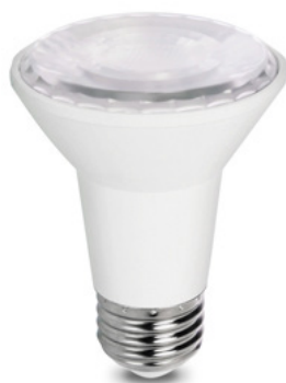
Item#: 91736 LED PAR20 LAMP REFLECTOR (NARROW FLOOD)