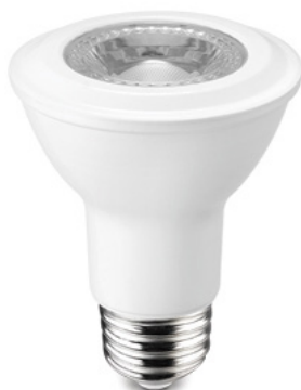
Item#: 91932 LED PAR20 LAMP REFLECTOR (NARROW FLOOD)