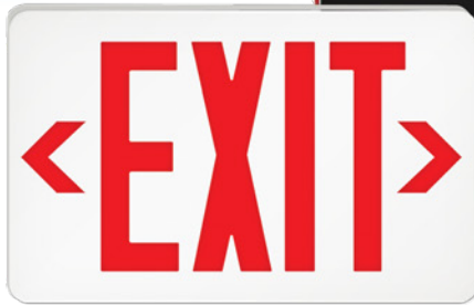
EXIT SIGNS 82208/82205