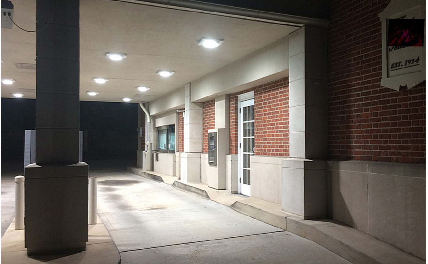
LED Lighting 75W LED