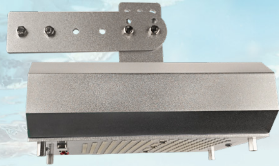
SHOE BOX RETROFIT Mounting Kit Included*