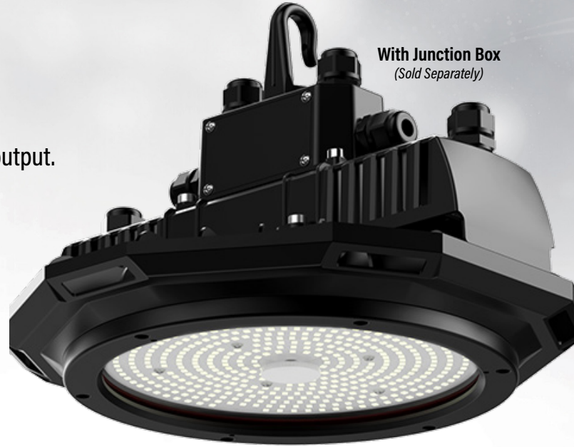
With Junction Box (Sold Separately)