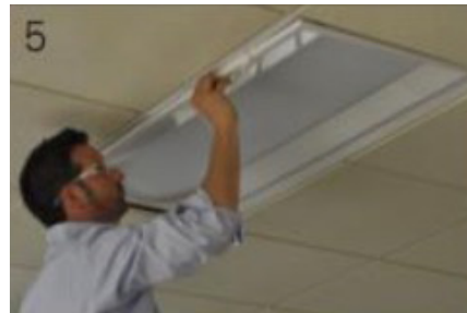
5. Close the lens and secure latches.