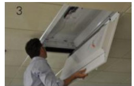
3. Install supplied brackets and then the completely assembled fixture in bracket holes.