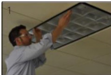
1. Turn off the fixture, remove existing lens of louver or troffer.