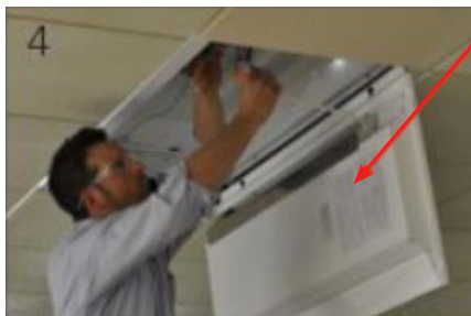
4. Reconnect wiring to the retrofit kit.