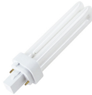
PLC / 2 PIN