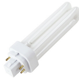
PLC / 4 PIN