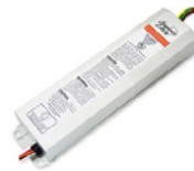
82195 / 82233