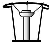
SUPER LIFE™ FILAMENT 5 Filament Supports Designed for Longer Life in Any Mounting Position